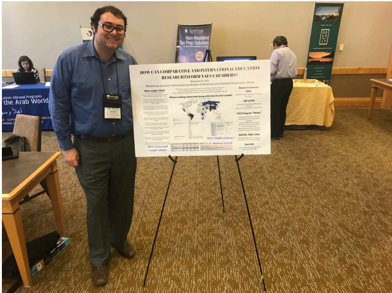
October 18, 2018, 11:12am: Thanks to Student Council Conference Funding, I had the opportunity to attend the NAFA Region 1 Annual Conference in Vancouver, Canada, where I had the opportunity to present my personal research project and network with other international educators based in Oregon, Washington, Idaho, Alaska, and British Columbia.