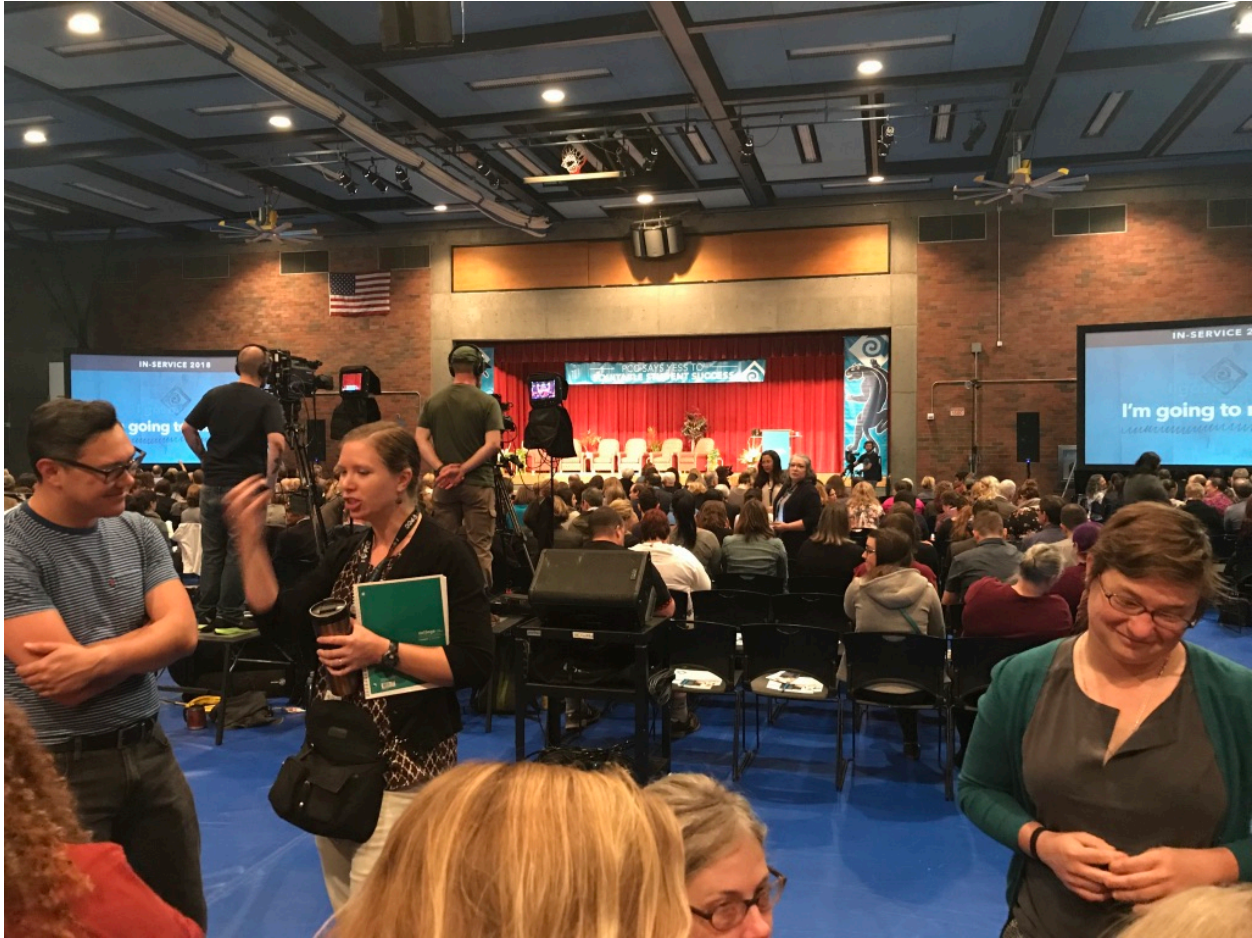
September 17, 2018, 9:31am: Right before the start of new academic year, I had the opportunity to attend PCC inservice. This is the one day of the entire year that all staff convene. During the President's presentation, our office got a shout-out.