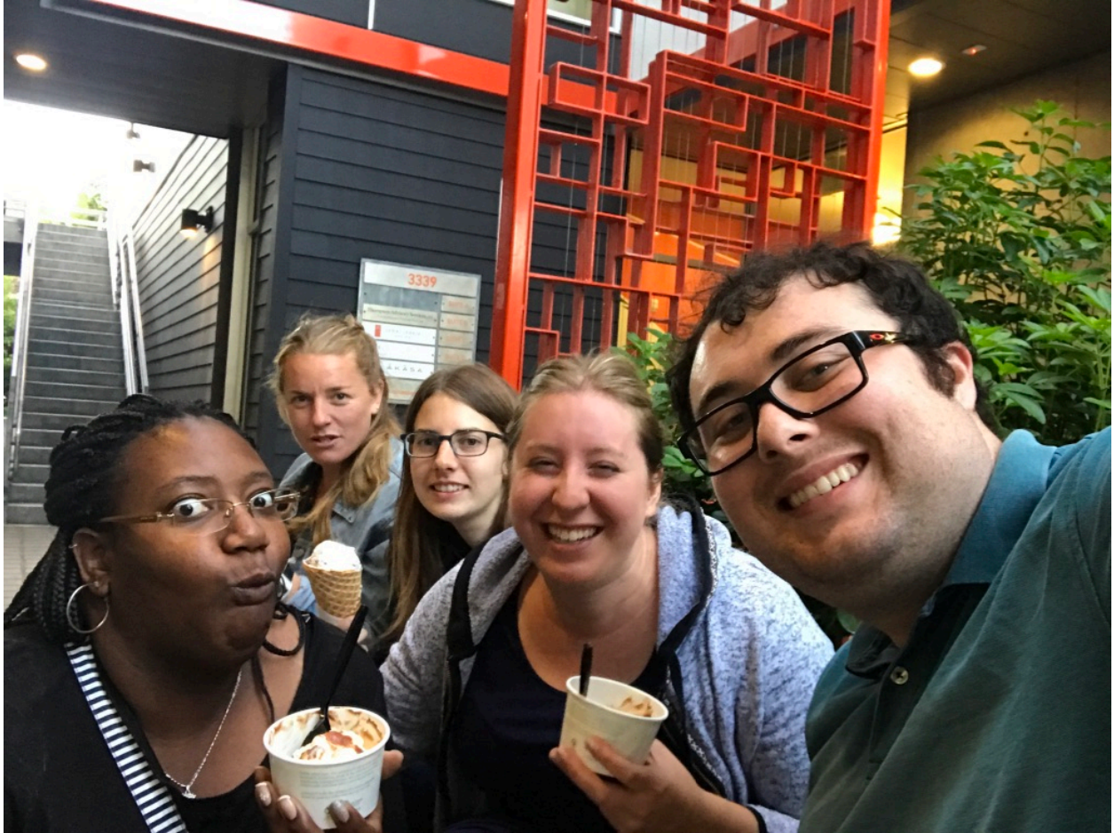
July 19, 2018, 8:28pm: Don't forget that the MIIS network is everywhere. Starting practicum was difficult but there were always great people around to give me support – both near and far.