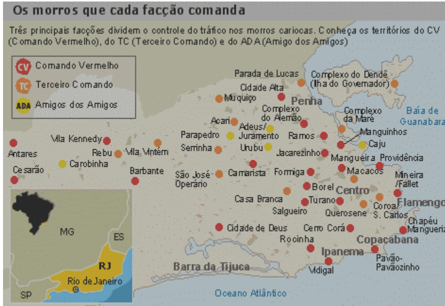
Map 1 – Relief of Rio de Janeiro. Red, Yellow and Orange dots represent favela communities under the control of one of three drug gangs.