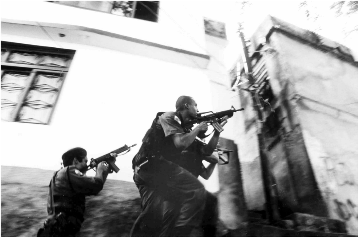
Photo of invading military police officers in a favela community.