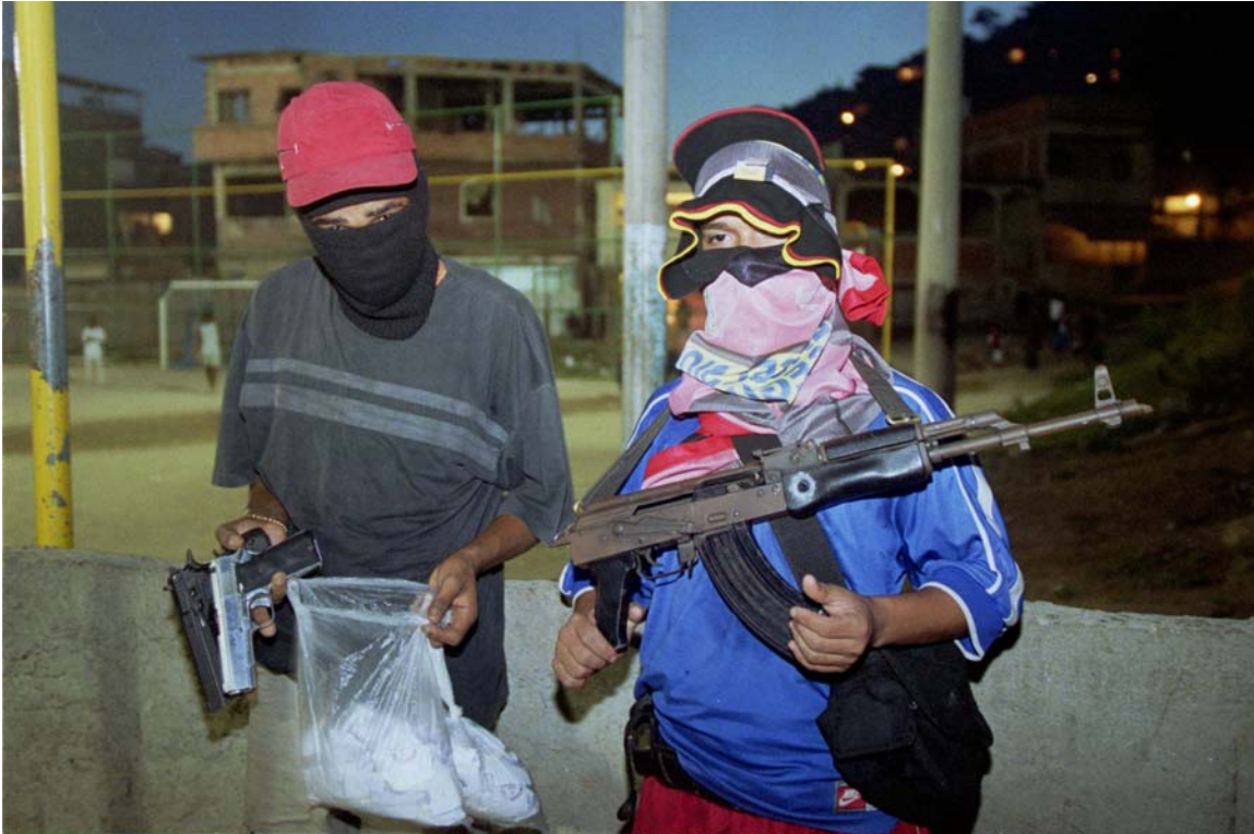
Photo of Commando Vermelho “soldado,” 16 years of age, with an AK-47, and a “vapor,” 15 years of age, with two 9mm pistols and cocaine.